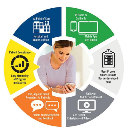
Fig-3: Compliance Monitoring [106]

The improvement of compliance (Figure-3) will result in a situation in which all parties benefit. Most importantly patients benefit from the enhancement of the efficacy and safety of their drug therapy. Pharmacists benefit because there is an increased recognition and respect for the value of the advice and service that they provide. Pharmaceutical manufacturers benefit from the favorable recognition that accompanies the effective and safe use of their drugs as well as from the increased sales resulting from the larger number of prescriptions being dispensed. Finally, society and the health care system benefit as a result of fewer problems associated with noncompliance. Although an increase in compliance will result in more prescriptions being dispensed and a higher level of expenditures for prescription medications, this increase in costs will be more than offset by a reduction in costs (e.g., physician visits, hospitalizations) attributable to problems due to noncompliance [60, 61].