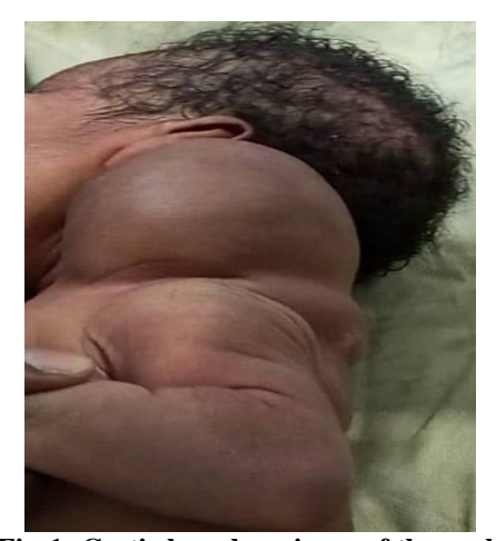
Fig-1: Cystic lymphangioma of the neck

the neck. By transverse incision figure(2) we proceeded to a surgical intervention and removed en bloc the mass whose content was liquid figure[4] while sparing the vasculo-nervous bundle of the neck which is included between the sterno-cleido-mastoid muscle in before and the plane of the scalene muscles behind (figure: 3), after installation of a drain. This intervention occupied 0.30% of our interventions in 2021, which explains its rarity. The pathological examination of the surgical specimen led to the diagnosis of cystic lymphangioma of the neck. The postoperative course was simple, with no infection, right upper limb paralysis or dysphonia (figure: (5).