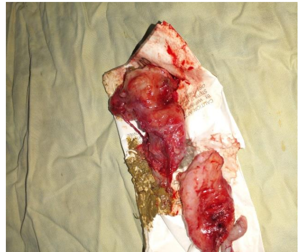
Fig 3: Resected tumor