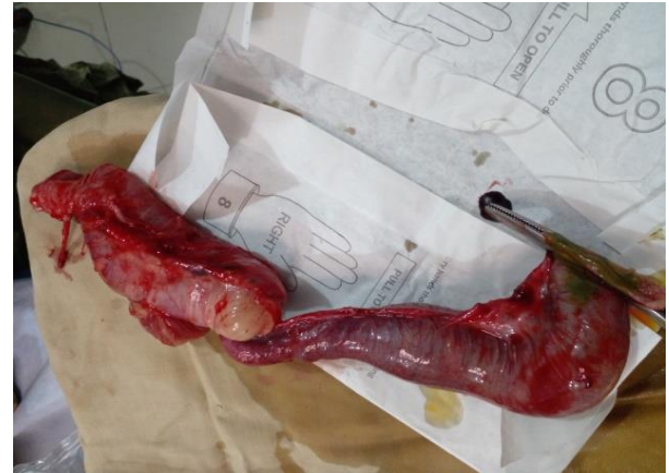
Fig 2: Necrotic sausage resected after resected tumor

During the study period (January 2019 to December 2021), we had collected 63 cases of mechanical acute intestinal obstruction in children, including 27 cases of acute intussusception, i.e. 42.85% of cases and i.e. 2, 76% of all interventions in 3 years. We had noted a slight increase in cases during the months of February to June. Acute intussusception had a frequency of 9 cases / year. The notion of vaccination was not taken into account during this study. The male sex was predominant (18), i.e. 66.66% of cases and the female sex 9 cases, i.e. 33.33% (Table 2). The patients were aged from 4 months to 48 months. Infants aged 4 months to 24 months represented 74.07% (n=20) and 7 were under age or equal to 4 years, i.e. 25.92% (Table 3) patients (Table 1). Intraoperatively we had discovered 16 ileo-coeco-colic intussusception, that is 59.25%; 7 colo-colic, i.e. 25.92% and 4 ileo-ileal, i.e. 14.81% (Table 4) and 4 stomas. We had detected a case of intussusception secondary to a sigmoid tumour: Fig 3 whose anastomosis resection had been performed intraoperatively Fig 4. Anatomopathology found a benign tumor. The 4 patients with ostomy underwent an end-to-side ileocecal anastomosis. In the postoperative course, we recorded two parietal suppurations and one eventration. We had recorded two cases of death, i.e. 7.40%