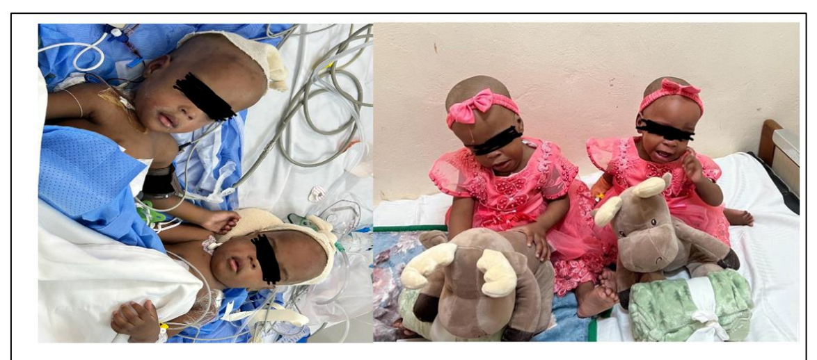
Figure 4: Twins postoperatively at the PACU and 5 days after surgery in hospital room

By making this division of tasks, the anesthesia was carried out without interference or hesitation. The twins were successfully separated 2 hours after anesthetic induction. The operating time was 2 hours with a total time of 5 hours and extubation in the SSPI at 6 hours (fig 4.). No incident or complication was noted. Postoperative follow-up with a 13-month follow-up shows that the twins are alive with good height and weight growth and good psychomotor development, currently aged 2 years.