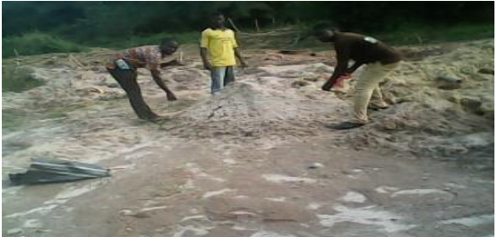
Plate-5: Heaped Laterites at Mpatuam