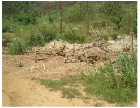
Plate-1: A mining site at Manhyia

An overview of illegal mining sites in some of the communities showing Species diversity is shown in Plates 1 and 2.