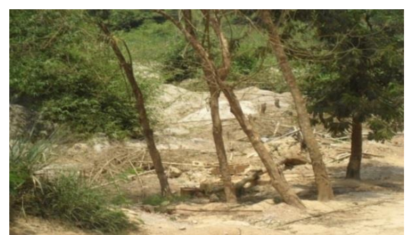
Plate-6: Land Degraded at Manhyia