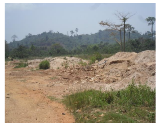
Plate-2: A mining site at Mpatuam