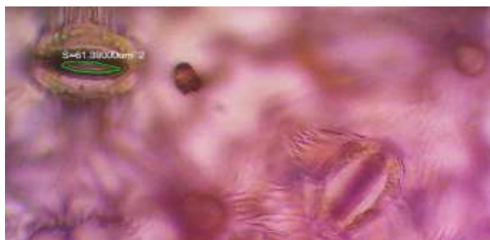
Fig-3: Cross-section of the aromatic geranium leaf, Pelargonium graveolens L., taken from plants growing under 100% irrigation level of F.C. spraying at 25 mg.l -1 proline and 1ml.l -1 Optimus plus (40x)