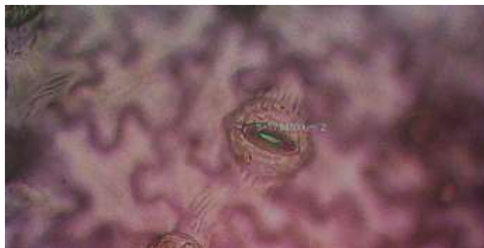
Fig-2: Cross-section of the aromatic geranium leaf, Pelargonium graveolens L. taken from plants growing under 25% irrigation level of F.C. (40X)