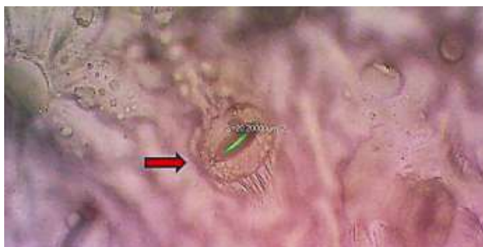
Fig-4: Cross-section of the aromatic geranium leaf, Pelargonium graveolens L., taken from plants growing under 25% irrigation level of F.C. spraying at 50 mg.l -1 proline and 1ml.l -1 Optimus plus (40x)