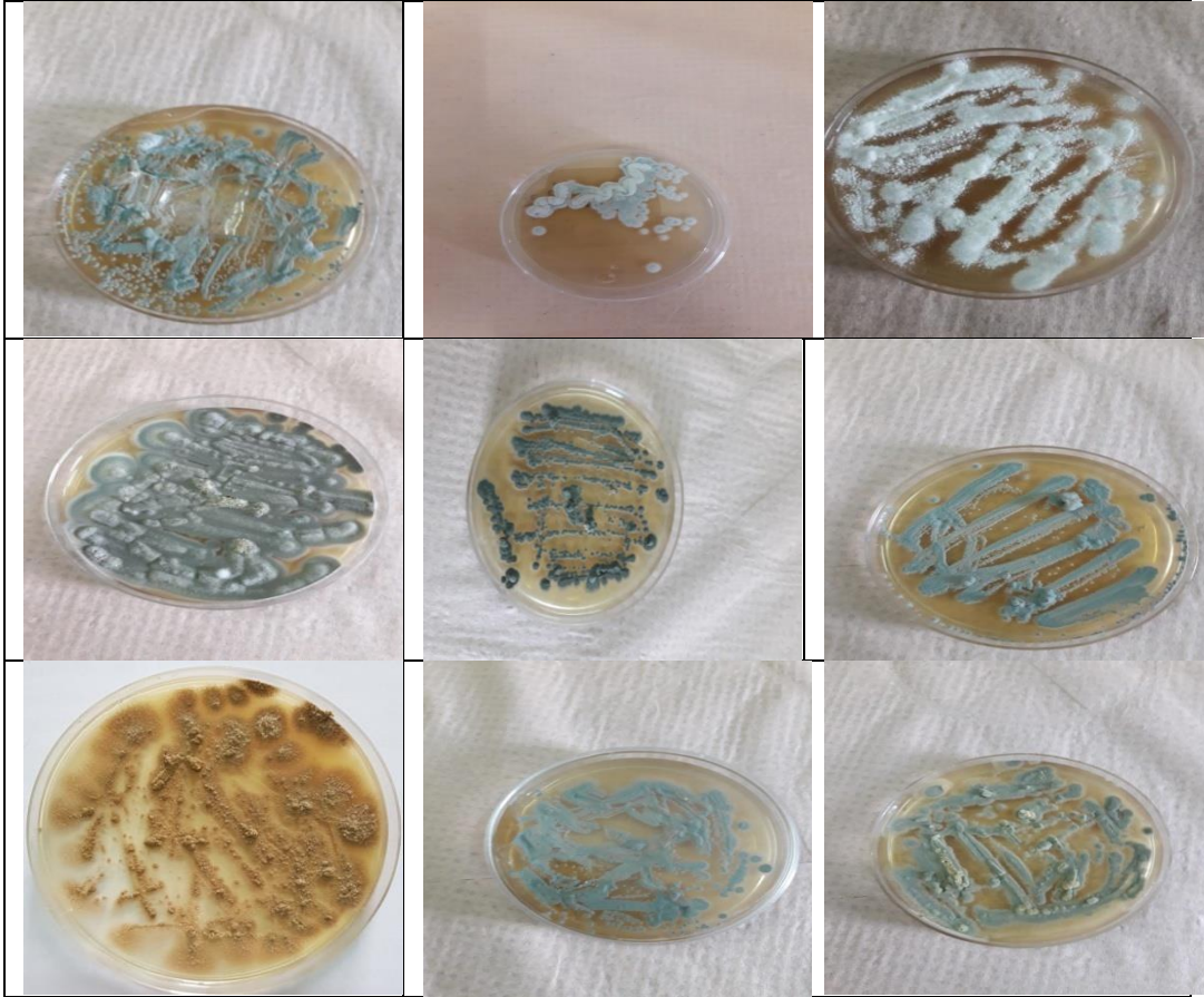
Fig (1): Local Actinomycetes spp. isolates grow on glycerol yeast extract agar (GYEA) for 10- 12 days