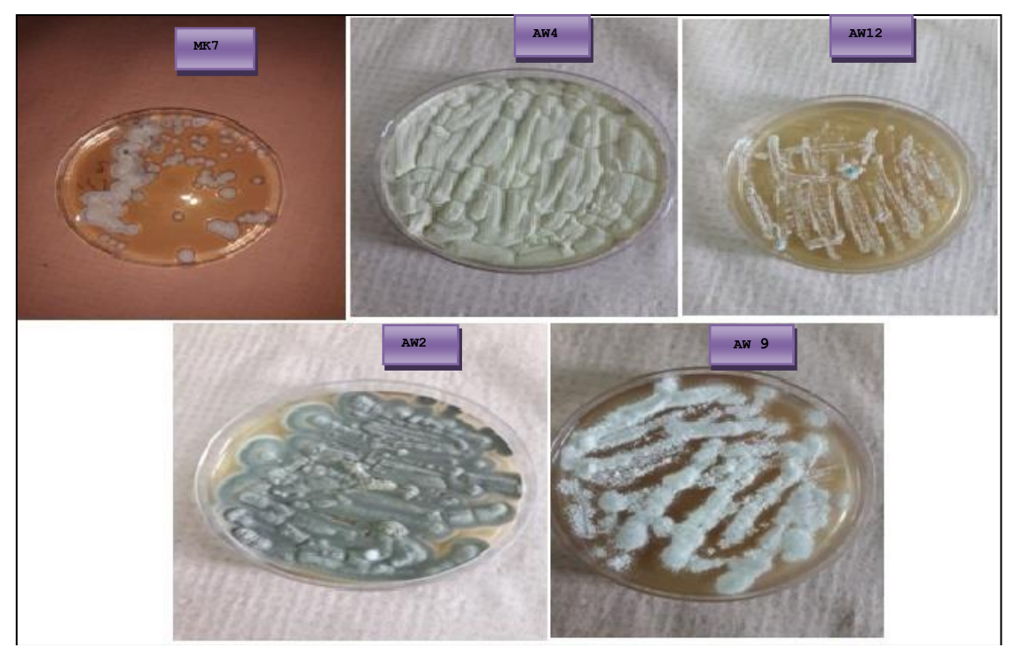
Fig (2): Local Actinomycetes Spp. Isolate grow on on glycerol yeast extract agar (GYEA) for 10-12 days