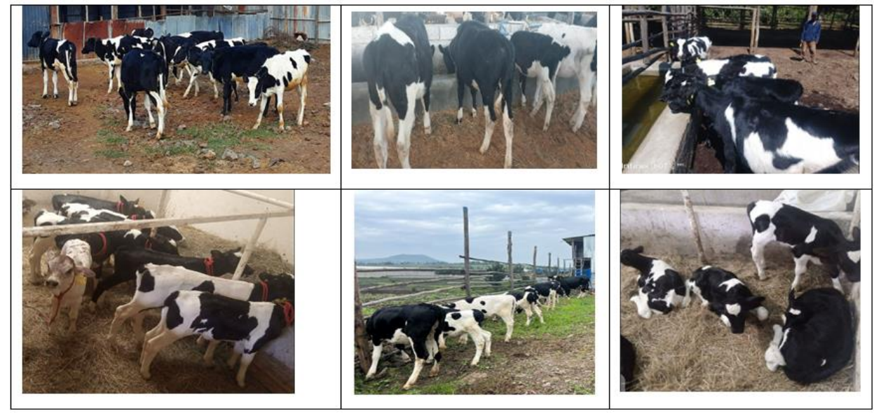
Figure 4: Calves born on research station and private dairy farm using sexed semen (F1) at DZARC

HF: Holstein Friesian breed; B=Boran Breed