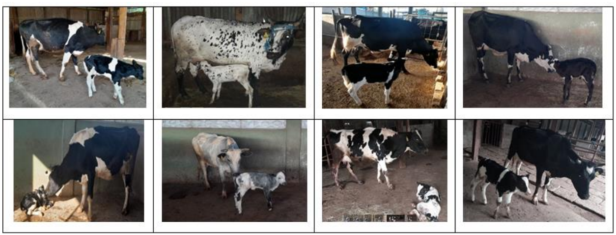
Figure 5a: Heifers born from sexed semen give female calve crops (seedstock) after estrus synchronized and inseminated with sexed semen (F2)