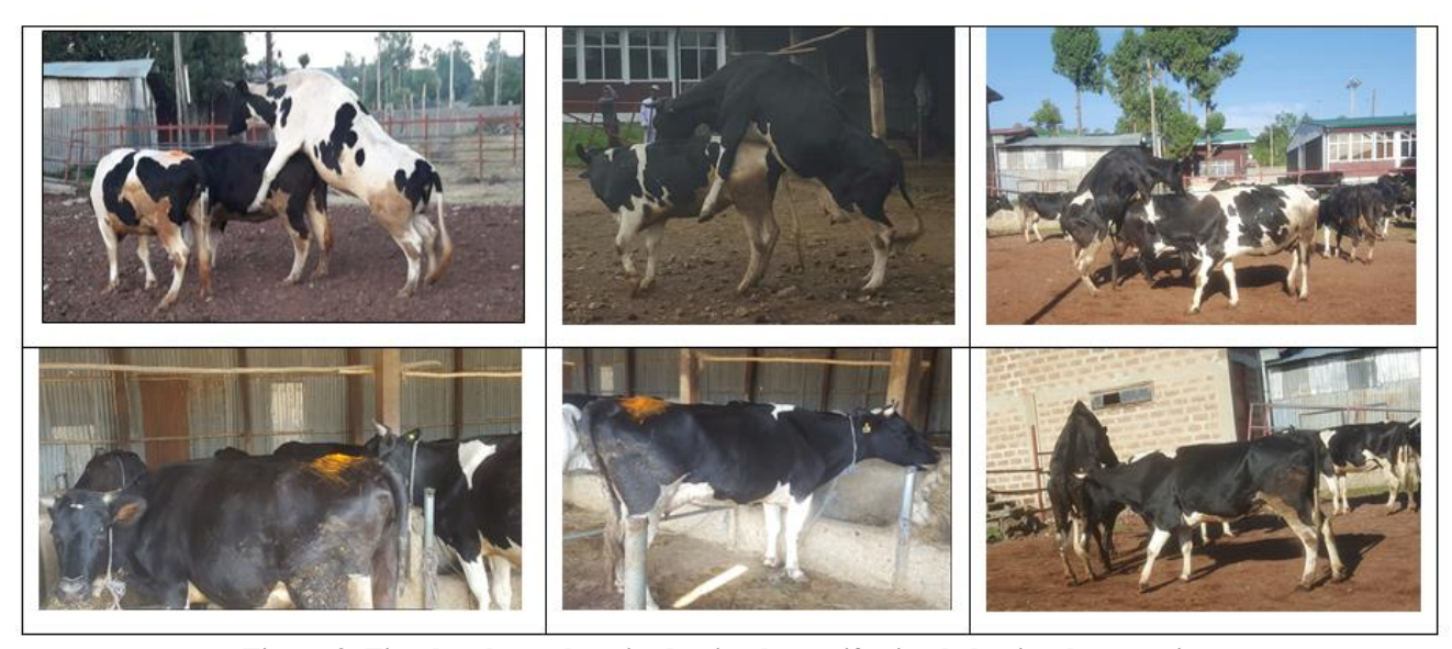
Figure 3: First batch synchronized animals manifesting behavioral estrus sign