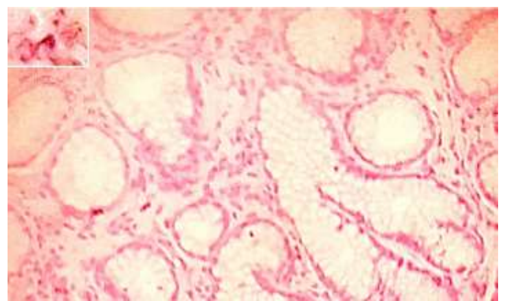
Fig. 1: Haematoxylin and Rubia (H&R) staining shows numerous Helicobacter pylori which are stained deeply in comparison to usual H&E staining and delineated clearly for easy diagnosis. Enlarged deeply stained bacteria are shown in the left upper box

The staining with Haematoxylin and Rubia showed excellent results revealing many H. pylori that were not visible with routine H&E stain. However, when stained with only Rubia, although some bacteria stained deeply after prolonged staining the staining is not as good as Haematoxylin and Rubia stain (Fig. 1 and Fig. 2). Thus this staining procedure appears ideal for histological staining of H. pylori .