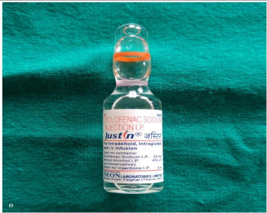
Figure 1: A. Transdermal Diclofenac Patch; B. Vial of Intramuscular Diclofenac Injection

A transdermal diclofenac patch containing 100 mg was applied to the subjects in Group A 2 hours before the beginning of the surgical intervention on non-hair bearing area like the Deltoid region.