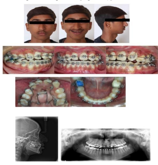
Fig.3 Mid- Treatment Photographs & Radiographs

Stage records showed significant changes in the patient's profile [figure 3)].