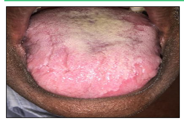
Fig. 2: Oral Candidiasis with Geographic and Fissured Tongue