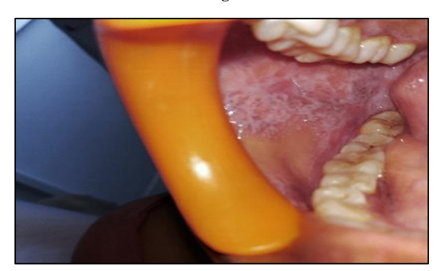
Fig. 3: Oral Lichen Planus