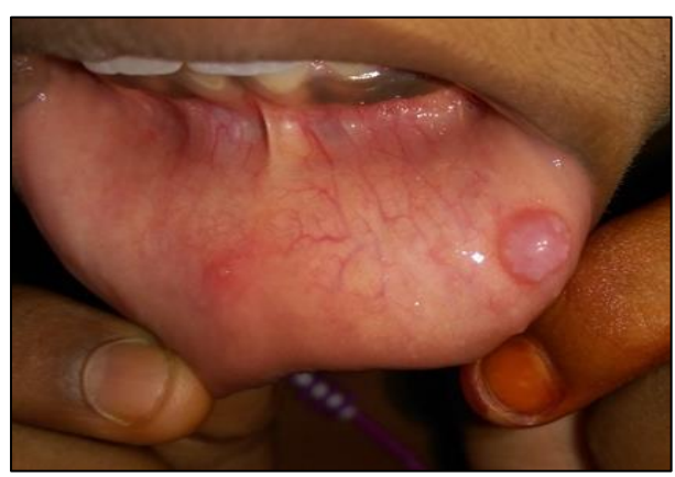
Fig. 5: Mucocoele