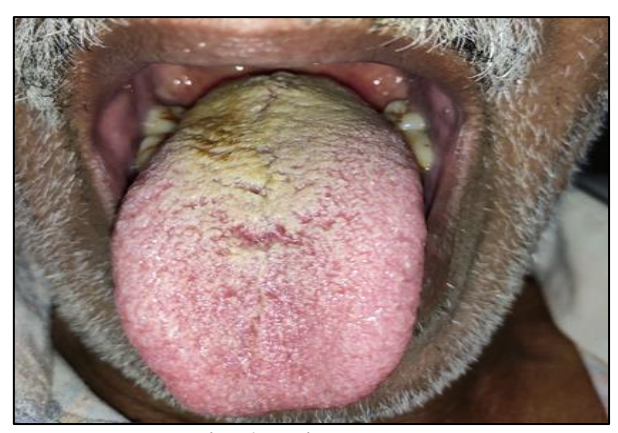
Fig. 6: Hairy Tongue