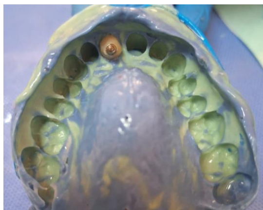
Fig 8: Final Impression with Open Tray Technique