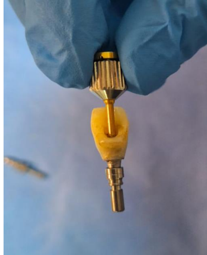
Fig 3: Fixing the Provisional Prosthesis onto the Implant Analog

The provisional prosthesis was securely attached to the implant analog using the implant-specific screwdriver, ensuring accurate reproduction of the implant's position for precise recording of the emergence profile (Fig 3).