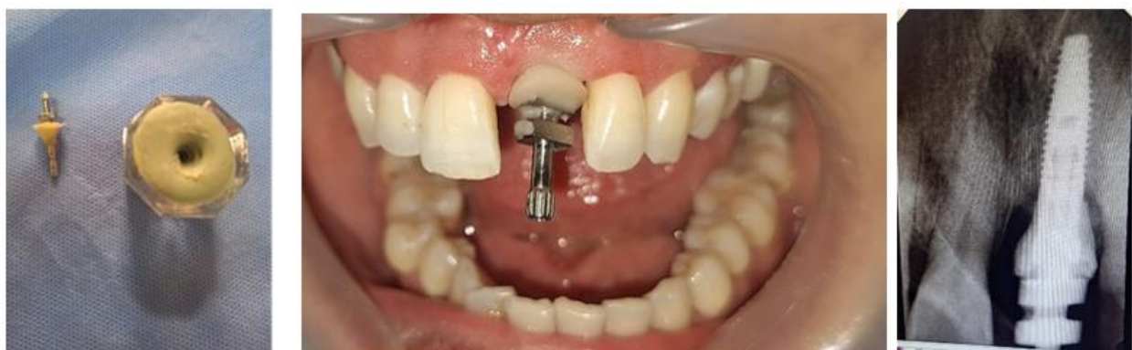
Fig 7 (a-b-c): Placement of the custom transfer in place and control X-ray of its adaptation

connecting it securely to the implant interface to ensure the emergence profile was accurately replicated (Fig 7).