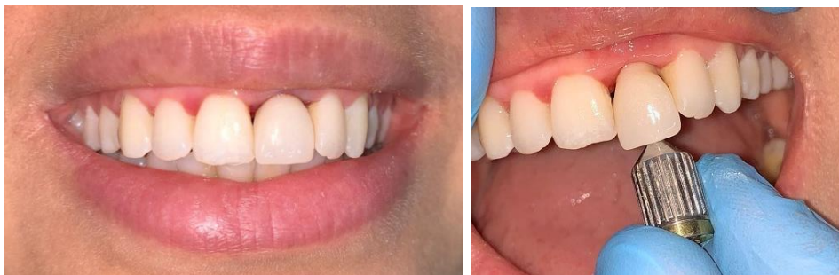
Fig 2(a-b): Removal of the screw-retained provisional prosthesis on the implant

Before proceeding with the impression, the provisional prosthesis was carefully assessed for both aesthetic and functional purposes. The morphology of the provisional prosthesis was evaluated in the patient's mouth to ensure it was aligned with the natural dental arch. Any necessary corrections were made to the provisional prosthesis to optimize the soft tissue contouring and ensure proper healing of the peri-implant tissues (Fig 2).