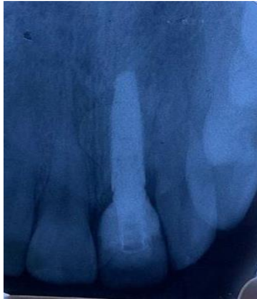
Fig 1: Control X-ray after complete osteointegration of the implant

After successful osseointegration, the next crucial step was to record the emergence profile, which would play a significant role in achieving the desired aesthetic and functional outcome for the final prosthesis (Fig 1).