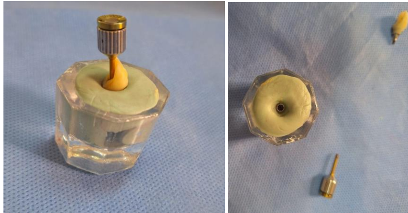
Fig 5(a-b): After complete polymerization of the silicone, disconnection of the provisional crown

A custom transfer impression was then attached to the implant analog, facilitating the accurate transfer of the emergence profile from the provisional prosthesis.