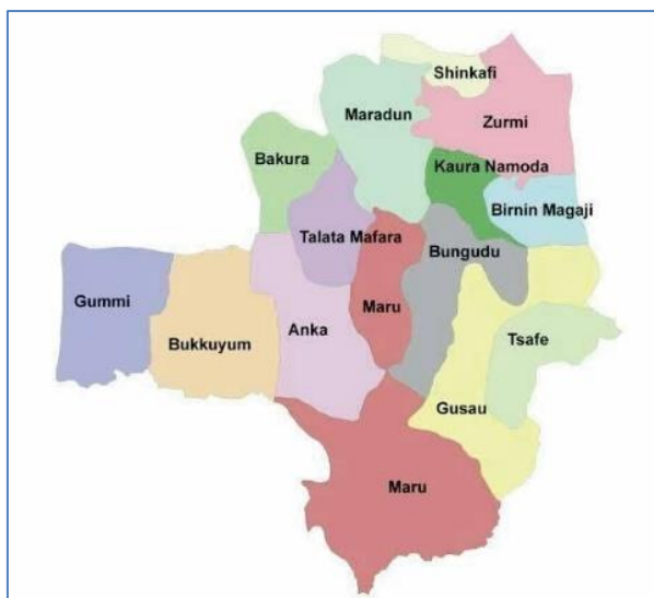
Fig-1a: The Map of Zamfara State