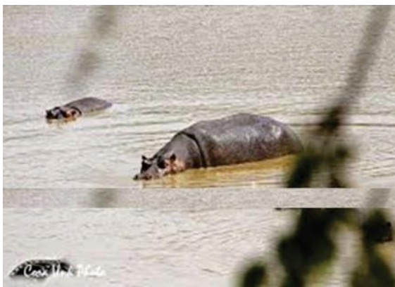
Fig-2a: Kalale Hippopotamus Pond (Old Site)