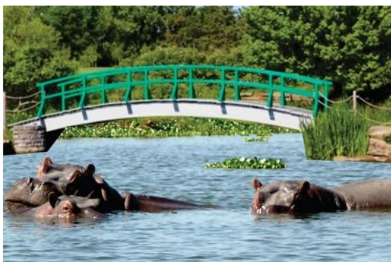
Fig-2b: Kalale Hippopotamus Pond (Proposed Site)

The image in Figure 3 below shows the Boziya plains and improved water ways for conservation. This site is of great natural attraction and will serve as a source of water conservation to support livestock production, fish production, game reserve development, pasture improvement and irrigation agriculture respectively. It has the potential support for rural economic and cultural development in Zamfara State. In fact, the cool down restive nerves over pasture resources from the month November/December livestock watering points usually become dried due to shortage of annual rainfall. In other words, this challenge has grossly hampered the management of livestock by semi-nomads in all year round pastoralists and agro-pastoralists.