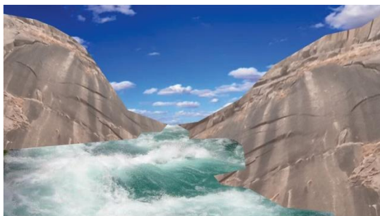
Fig-3: A Section of the Proposed Boziya Tourist Site and Water Conservation

The image in Figure 3 below shows the Boziya plains and improved water ways for conservation. This site is of great natural attraction and will serve as a source of water conservation to support livestock production, fish production, game reserve development, pasture improvement and irrigation agriculture respectively. It has the potential support for rural economic and cultural development in Zamfara State. In fact, the cool down restive nerves over pasture resources from the month November/December livestock watering points usually become dried due to shortage of annual rainfall. In other words, this challenge has grossly hampered the management of livestock by semi-nomads in all year round pastoralists and agro-pastoralists.