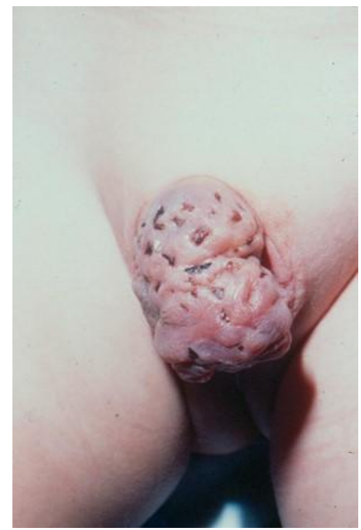
Fig-8: Overcoming of phimosis but still maintaining the full preputial skin

Edema may remain for several days, but when it completely fades away, then the penile look just looks normal and ...... with no phimosis.