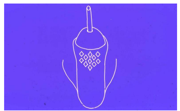
Fig-4: Schematic Drawing of the "opened" preputial incisions