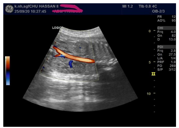
Fi-2: Demonstration abnormal renal arteries by power Doppler at 31 weeks. (presence of a lone artery)