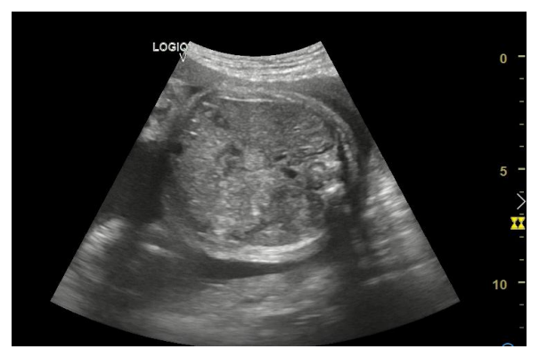
Fig-1: Axial scan at 31 weeks of gestation showing an empty renal fossa (and normal opposite kidney)

Which decision clinical and ultrasound monitoring