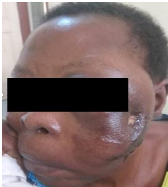
Figure 2: Photograph showing the mass on the left side of the patient's face and jaw.