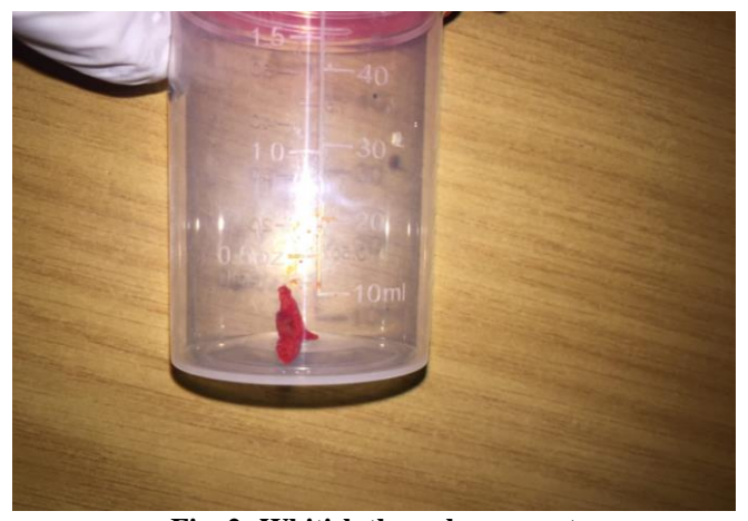
Fig. 2: Whitish thrombus aspect