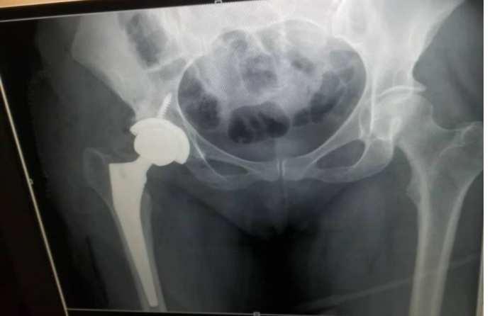
Fig-4: X-ray Post- operative Radiograph