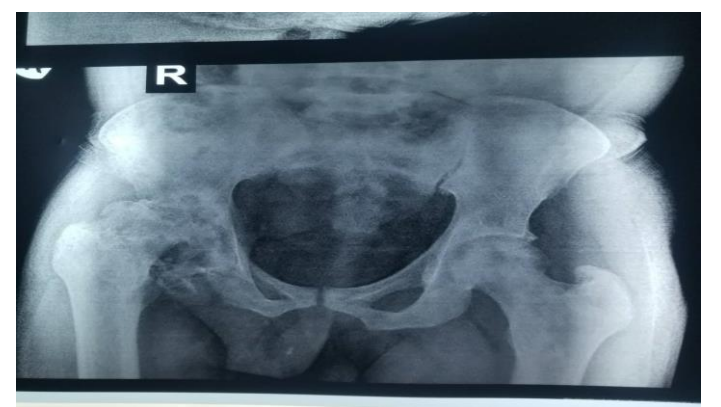
Fig-3: X-ray Pre- operative Radiograph