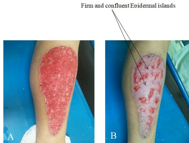
Figure 1: A: Leg Deep Second Degree Burn B: appearance of firm and confluent islands, after the second application of lysate Platelet and getting a thin and smooth-looking skin

It is necessary to emphasize the appearance of the first epidermal islets after the second application of the LP and the appearance of firm and confluent islands, after the third application; getting a thin and smooth-looking skin from the ninth day of receiving the application (figure 1).