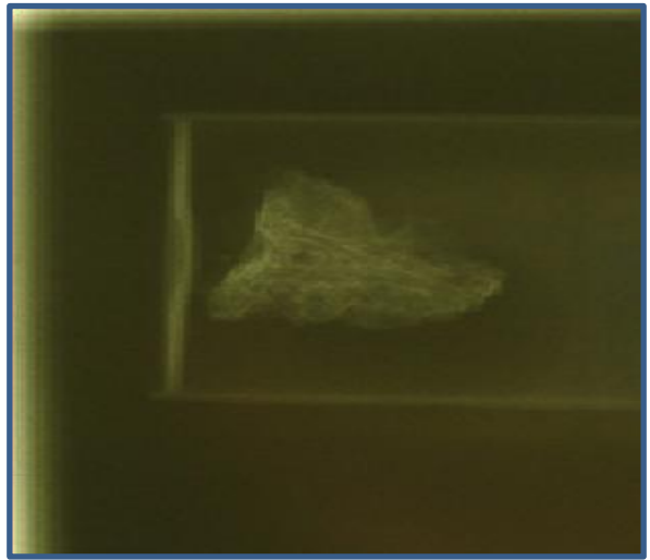
Figure 6: Standard X-ray of the excised coccyx