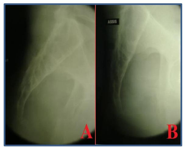
Figure 1: Standard radiographs: A: Standing profile of the sacrum, B: Sitting profile

performed under general anesthesia. The evolution was favorable despite sepsis which was controlled by twicedaily local care and antibiotic therapy. The patient is very satisfied after 1 year.