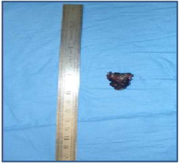
Figure 5: Intraoperative image showing the excised coccyx