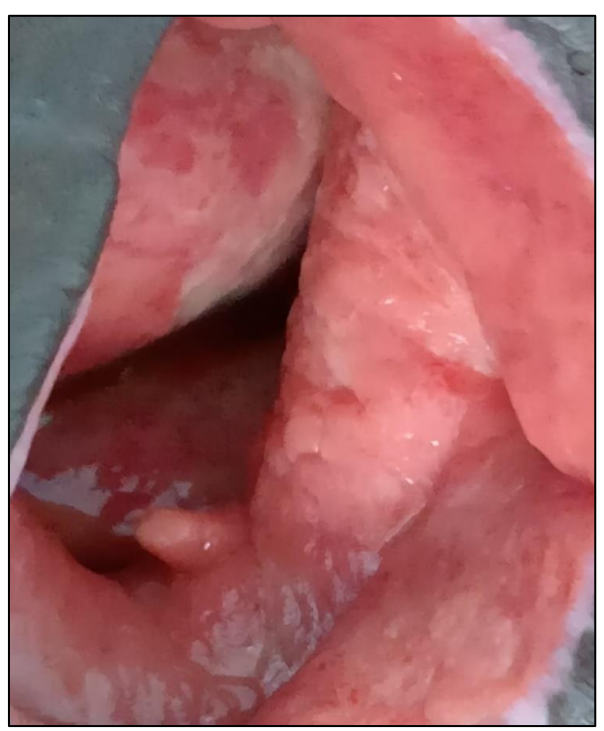
Fig 2: Photo showing good progress of the wound two weeks after applying Normal saline and honey