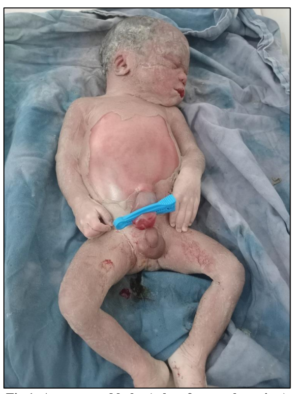
Fig 1: A macerated baby (taken from a close view)

part of the uterus, part of the intestines, the right iliac fossa, and the right ovary. The placenta was left in situ and the abdomen was closed. Three days later the incision site started oozing foul-smelling pus. The patient was then rushed to our facility for further management.