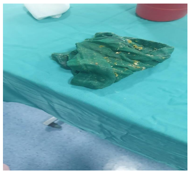
Figure 7: Surgical field extracted by fibroscopy