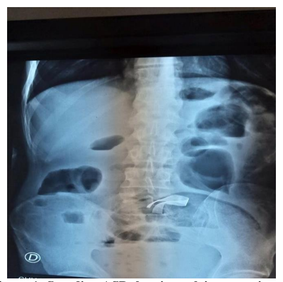
Figure 1: Standing ASP showing calcium tone image