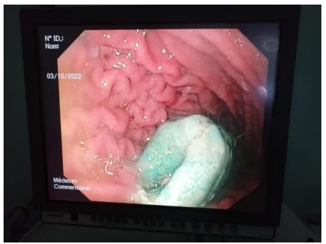
Figure 6: Image of gastric fibroscopy showing an operating field after intragastric migration