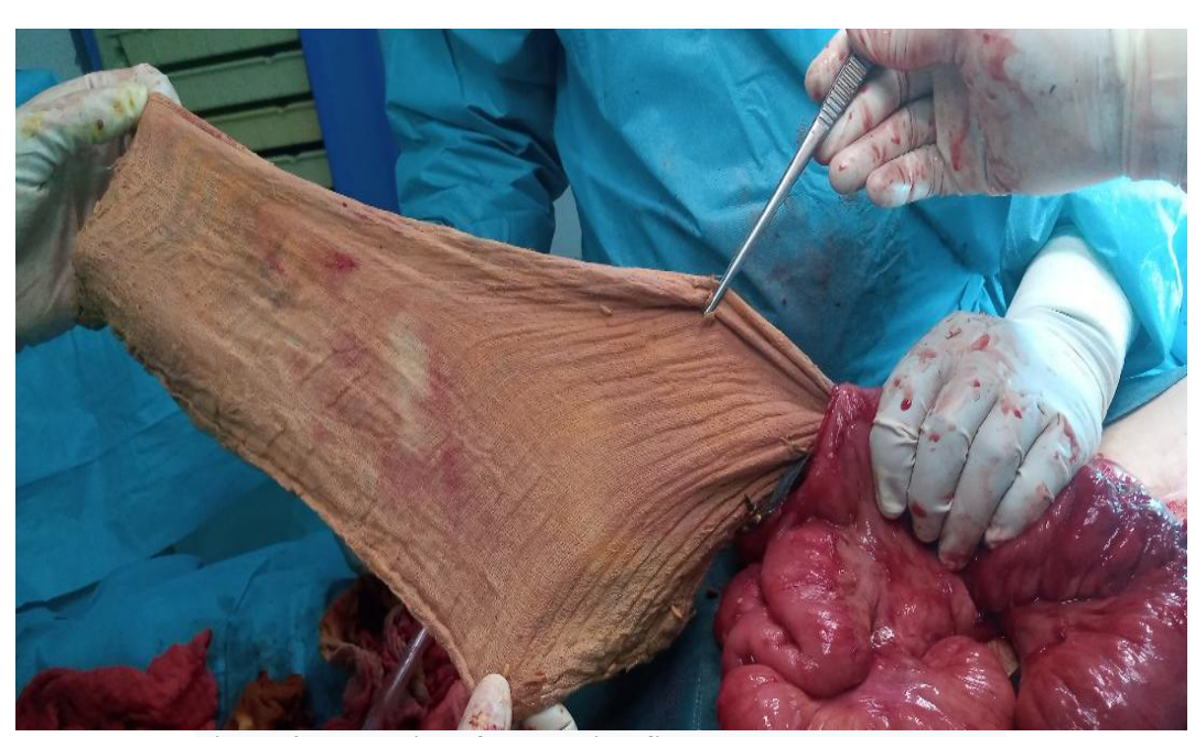
Figure 3: Enterotomy 80cm from the Bauhin valve