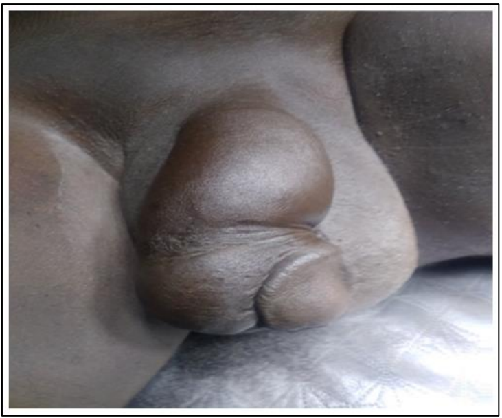
Figure 2: Penile fracture (aubergine sign)

Infectious diseases were dominated by gangrene of the external genitalia (2.88%, n=3), followed by acute pyelonephritis (1.92%, n=2) and acute orchiepididymitis (0.96%, n=1). According to the chronology of the hematuria, it was terminal in 5 of our patients (71.43%) and total in 2 cases (28.57%).