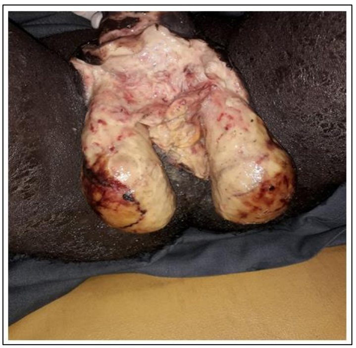
Figure 3: external genitals gangrene

The emergency management of our patients was dominated by urethral catheterization in 53.98% (n=61) followed by medical procedures sometimes associated with catheterization and bladder irrigation (6.20%; n=7) (Table 2). Figure 3 shows gangrene of the external genitalia.