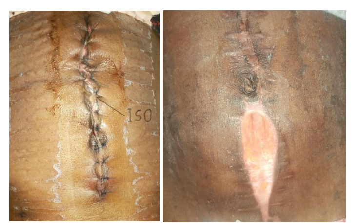
Image 2 and 3: Superficial ISO: on the left Acute generalized peritonitis by ileal perforation on D7 post-operative and on the right OIA by flange on D16 post-operative

Image 1: Deep ISO on postoperative day 12 of a left ovarian tumor