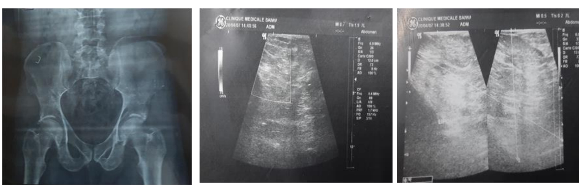
Figure 2: Patient Imaging study: X-ray (left) and ultrasound (center and right)