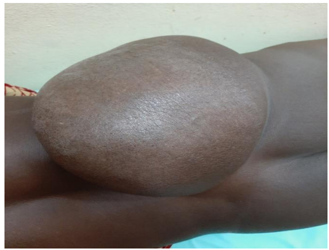
Figure 1: Preoperative state of the patient

The postoperative course was simple with good healing and patient satisfaction. After two years of follow-up, no recurrence was noted.