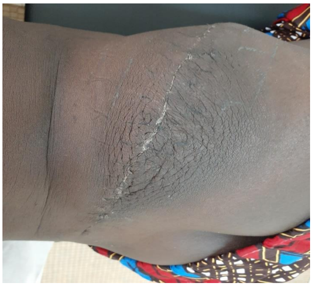
Figure 5: Postoperative state of the patient on Day 10