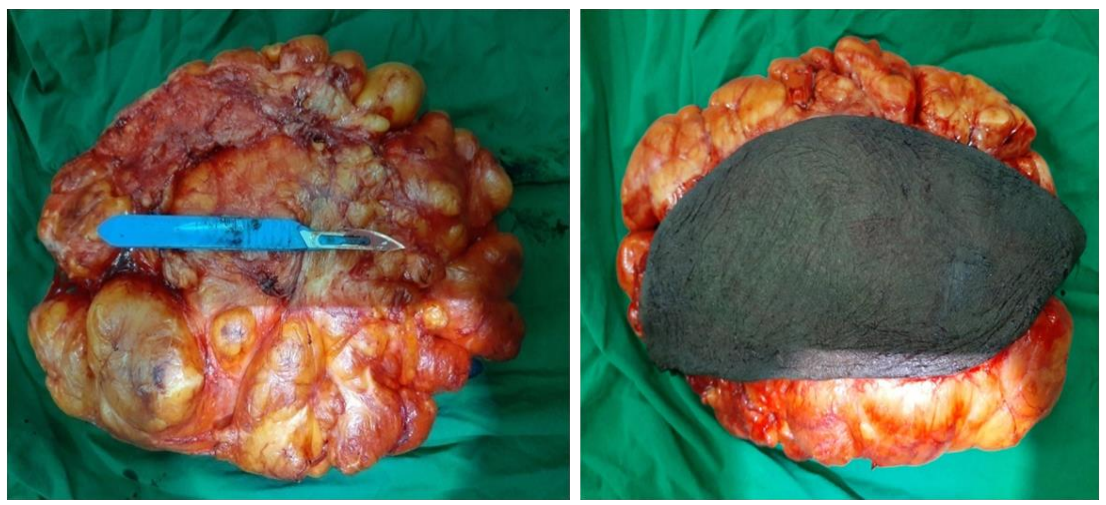
Figure 4: Operative specimen with lobules on the left and with skin flap on the right