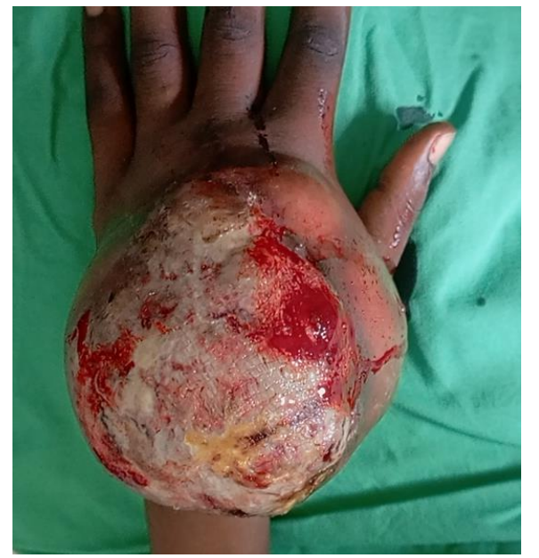
Figure 1: The gross image of the ulcerated- bleeding tumor on the dorsum of the left hand

Physical examination revealed an ulcerated, fixed and firm mass with unclear marginal of about 23 by 20 by 8 cm occupying the whole dorsum of left hand extending just above the left wrist joint to the metacarpopharyngeal joints. The overlying skin was shiny, smooth and had an ulcer of 10cm by 8cm which was non-tender and bled easily on touch (Figure 1). Flexion of the left metacarpo-pharyngeal joints were limited. No palpable axillary lymph nodes.