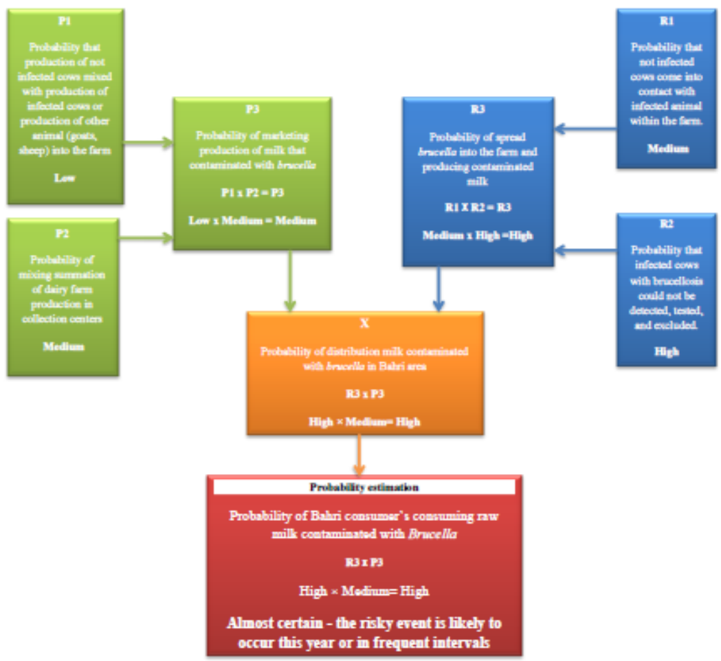
Figure (4): Overall Estimation of Risk *R = probability of release pathway. *P = probability of exposure pathway.

Although overall estimation of risk associated with brucellosis was found to be high, but results of survey among consumers shown that (91.7%) from consumers heated milk after purchased, (93.7%) heated milk to the degree of boiling, (75%) refrigerated milk after it was heated, and (83.3%) from consumers didn't have habit of drinking milk without heating. These treatments could decrease the risk raised from brucella to "LOW" at the point of consumption.