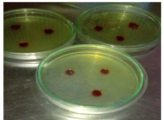
Fig-3(a): Well diffusion of beet root extract

study we observed the various zone of inhibition in beet root extract after analysis. The zone of inhibition are represented in the below Table-2. The zone of inhibition in tested extract are, Escherichia coli (15mm), Staphylococcus aureus (10mm) and Salmonella enteritidis (10mm). On the basis of the result obtained in this probation it can be conclude that beet root extract had momentous in vitro broad spectrum antibacterial activity.