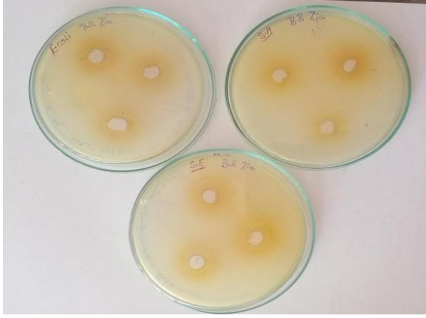
Fig-3(b): Zone of inhibition