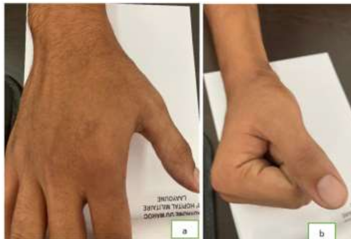
Fig-4(a, b): Postoperative result showing the proper recovery