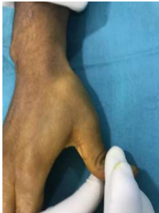
Fig-1: Clinical aspect revealing provoked trapeziometacarpal dislocation

postoperatively, at the periodic consultations and at the radiological follow-up, the patient had no recurrence with comfortable function of the hand (Fig 4 and 5).