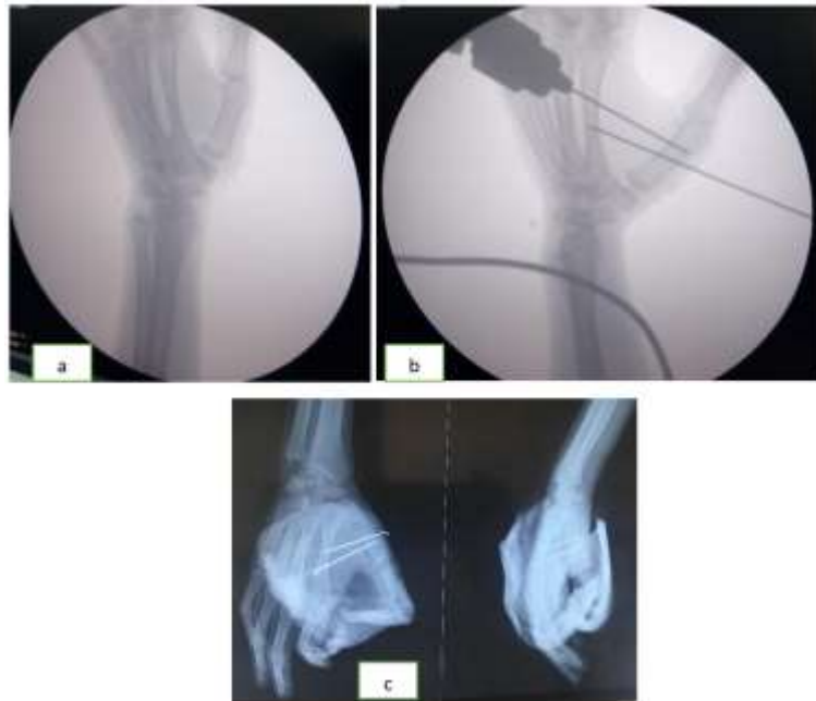
Fig-3(a, b, c): Kirschner wires fixation of first committal space (ISELIN technique). X-ray appearance