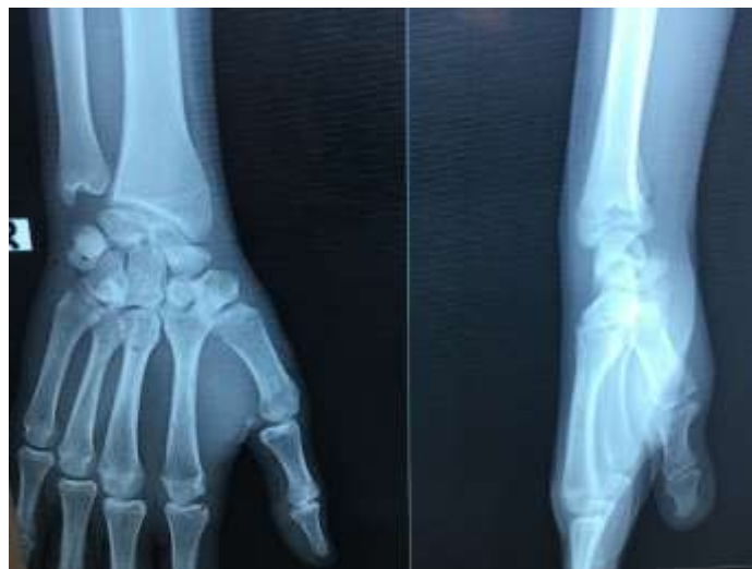
Fig-5: Radiological control after removal of material objectifying good articular congruency at the carpometacarpal joint of the thumb