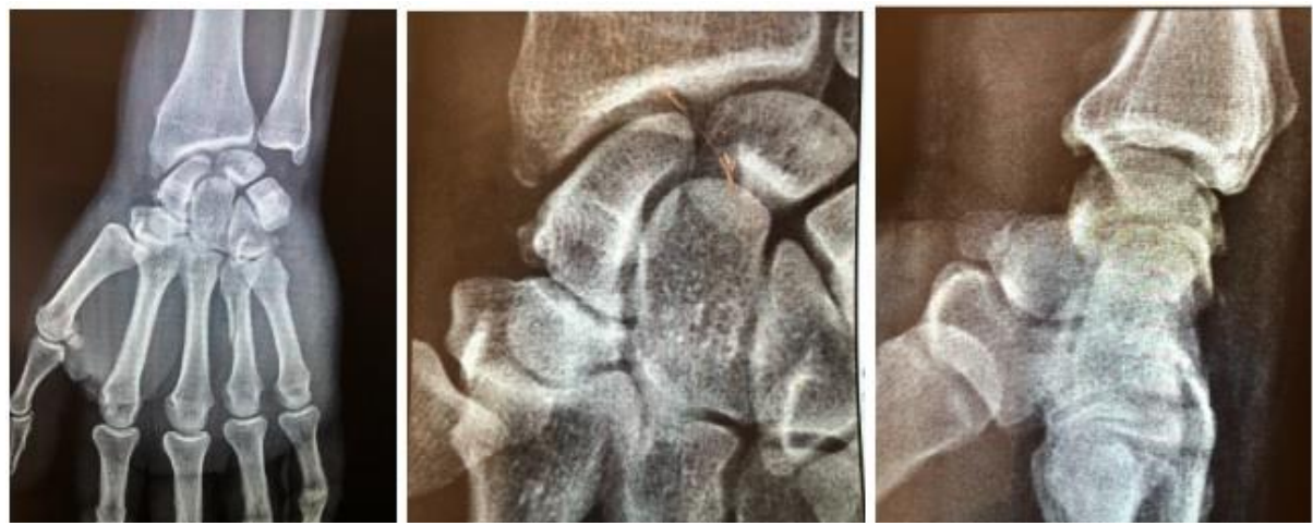
Figure 2: Radiographs at 6 months follow-up

At 6 months, the X-rays showed a full consolidation of the fourth metacarpal bone fracture and no signs of redislocation or avascular necrosis (fig 2).