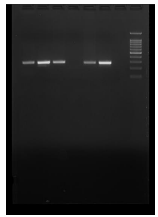
Figure 2: Gel electrophoresis showing the qnr gene

Abubakar Jibril et al, EAS J Parasitol Infect Dis; Vol-7, Iss-1 (Jan-Feb, 2025): 1-6