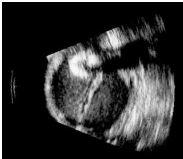
Fig-2: Displaced hypermature cataractous lens in eye through vitreous hemorrhage and whole retinal dispassion. Lens material is highly acoustically absorptive, resulting in an acoustic shadow trailing from the lens.[32]

divisions. Furthermore, studies displayed a considerable decrease in the mean assessment time for ocular trauma irrespective of patients' turnover [18]. Patients having complaints about posterior segment ultrasound B scan is suggested as preliminary investigating purposes but with monotonous repetition in ocular injuries.