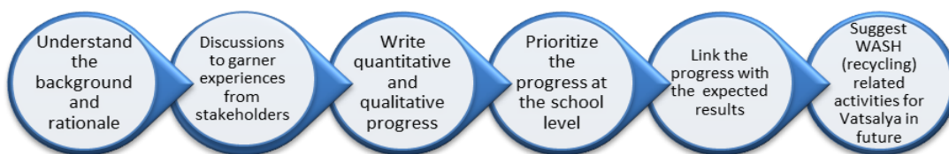
Figure 1: Flow chart of the report of the study