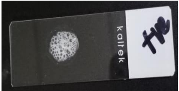
Figure 2.4: Slide catalase test for staph. Aureus