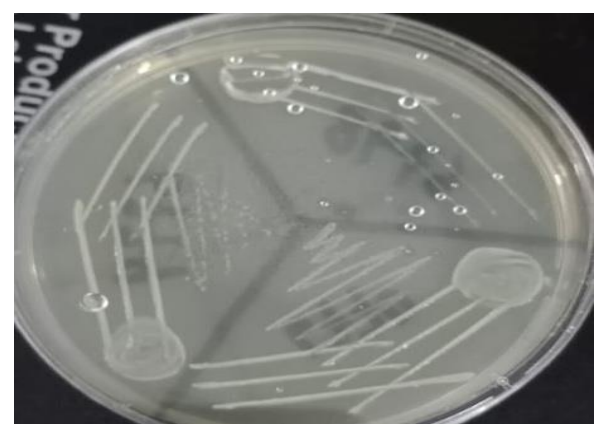
Figure 2.2: staphylococcus aureus colonies on Tryptic soy agar