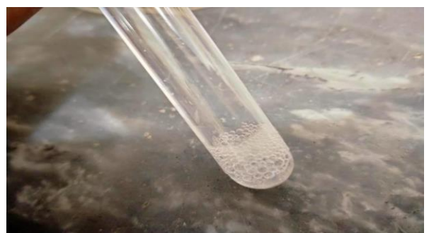
Figure 2.3: Catalase tube method for staph. Aureu