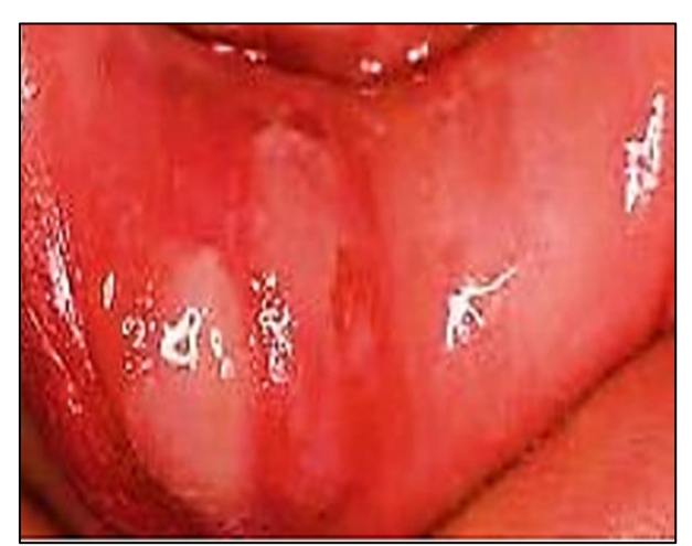
Figure 1: Ulcerations of the lower half-lip

lesions were oval, jagged edges with a granular bottom, and hollowed and covered with a whitish coating. They rested on an inflammatory nodule which extended away from the ulcerations (Figure 1).