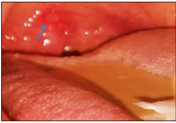
Figure 3: Ulceration of the uvula

The lesions disappeared three weeks after local symptomatic treatment (mouthwashes based on chlorhexidine gluconate 0.2%) and submucosal injections of Betamethasone.