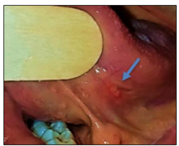
Figure 2: lingual ulceration

Other ulcerations were found on the ventral side of the tongue and uvula with the same characteristics. No examination was undertaken to find the etiology due to the patient's financial arrangements.