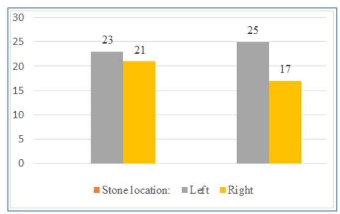
Fig-2: Stone location