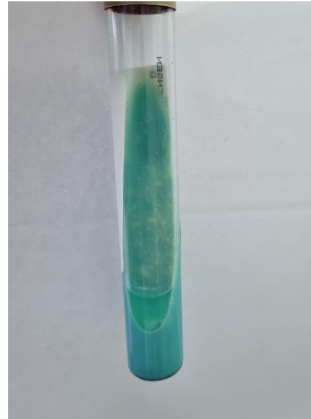
Figure 1: Mycobacterium tuberculosis colonies on Löwenstein-Jensen medium

Direct CSF examination after Ziehl Neelsen staining was negative, Culture on Lowenstein-Jensen medium became positive after one month (Fig 1).